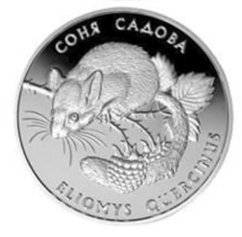
Figure 14. Garden Dormouse (gs) (NBU (2023a))

วารสารวิชาการผลประโยชน์แห่งชาติ Nationl Interest