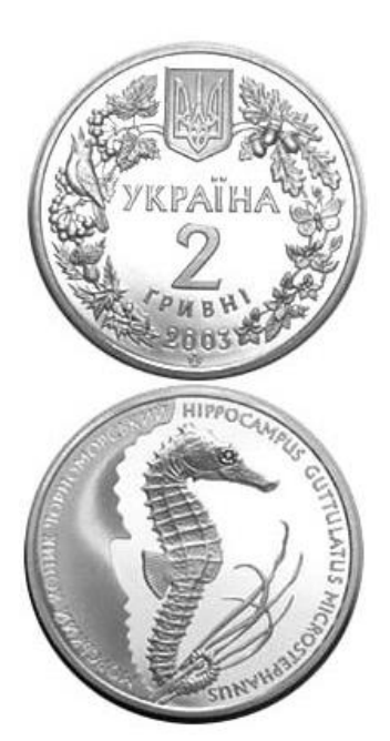
Figure 24. Seahorse (gs) (NBU (2023a))