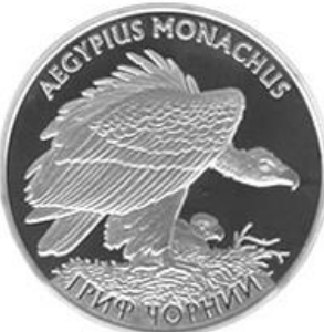
Figure 17. Eurasian Black Vulture (gs) (NBU (2023a))