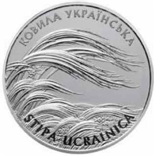
Figure 4. Stipa Ucrainica (gs) (NBU (2023a))