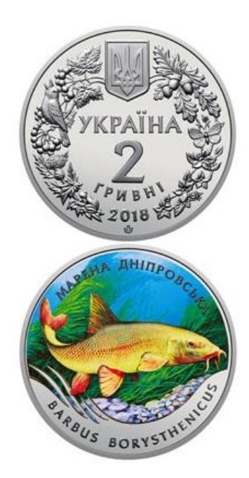
Figure 22. The Dnieper Barbel (gs) (NBU (2023a))