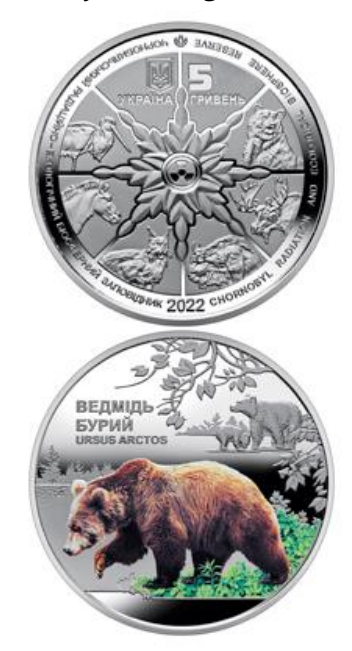
Figure 7. Chornobyl. Rebirth. The Brown Bear (gs) (NBU (2023a))