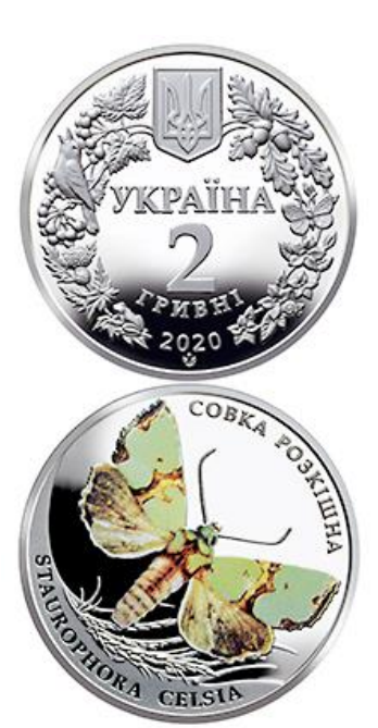
Figure 20. The Malachite Moth (gs) (NBU (2023a))