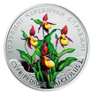
Figure 2. Lady's Slipper Orchid (gs) (NBU (2023a))