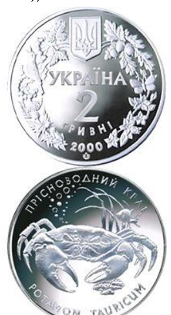
Figure 25. Freshwater Crab (gs)(NBU(2023a))