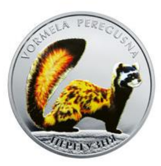
Figure 9. The Marbled Polecat (gs) (NBU (2023a))