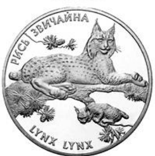
Figure 13. Lynx Lynx (gs) (NBU (2023a))