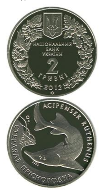
Figure 23. The Sterlet (gs) NBU (2023a) )