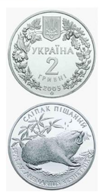
Figure 10. Spalax arenarius reshetnik (gs) (NBU (2023a))