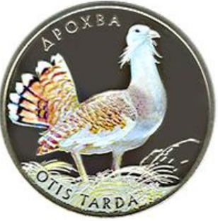
Figure 16. The Great Bustard (gs) (NBU (2023a))