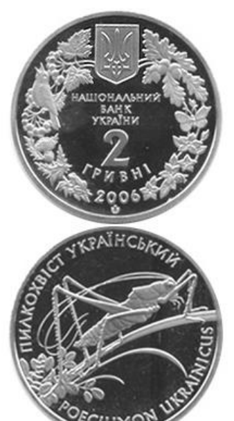
Figure 21. Ukrainian Bush Cricket (gs) (NBU (2023a))