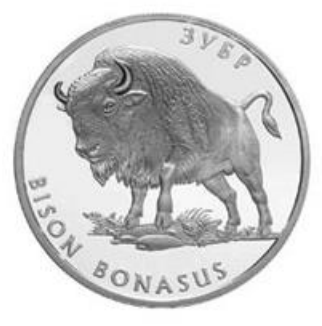
Figure 12. Bison Bonasus (gs) (NBU (2023a))