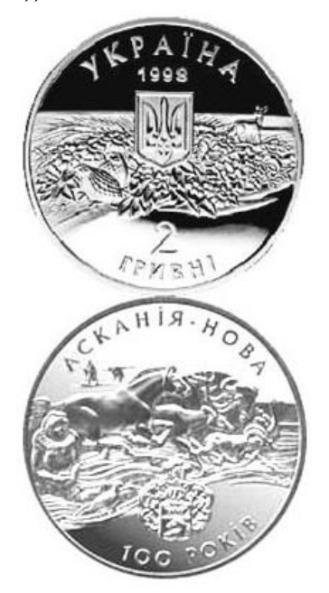
Figure 29. Askania-Nova (gs) (NBU(2023a))

Note that in order to avoid duplication of similar images on german silver and silver coins, only german silver coins are shown in the illustrations, as some of them have colored elements ( Fig. 2–28 ).