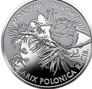
Figure 5. Polish Larch (gs) (NBU (2023a))