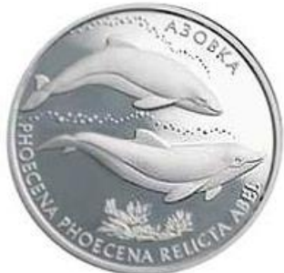
Figure 11. Azov Dolphin (gs) ( NBU (2023a))