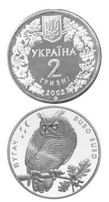
Figure 18. Eagle Owl (gs)(NBU (2023a))