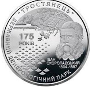
Figure 26. 175 years of the State Arboretum "Trostianets" (gs)(NBU (2023a))