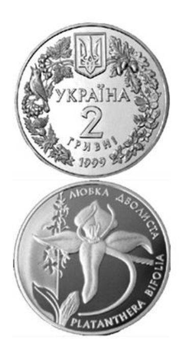
Figure 6. Butterfly Orchid (gs) NBU ((2023a))