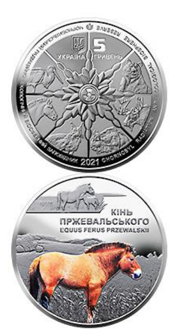
Figure 8. Chornobyl. Rebirth. Przewalski's Horse (gs) (NBU (2023a))