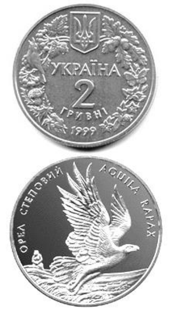
Figure 19. Steppe Eagle (gs) (NBU (2023a))