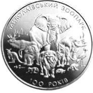
Figure 28. 100 Years of Mykolayiv Zoo (gs) (NBU (2023a))