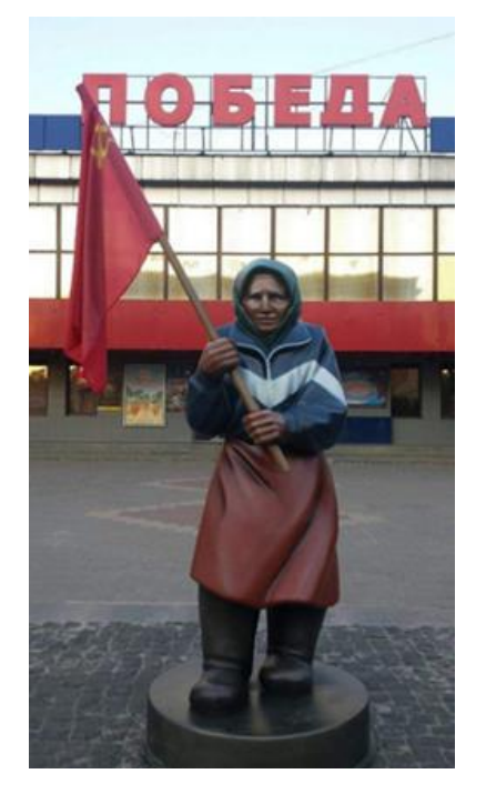
Figure 4 A Monument in Belgorod, Russia

The monument depicts poor, old, and presumably Ukrainian woman, seeing the Russian soldiers in, with the red (Soviet) flag in her hands. She is supposed to represent Ukraine as a tired, elderly female, happy to be "liberated" by the Russians. Consequently, Russian pictorial representation of Ukrainian identity is usually neither about beauty nor about courage, but rather about Ukraine being an inseparable part of Russia and Soviet Union, which is the reflection of the Russian narrative of a non-existent Ukrainian identity as it is portrayed by Russian mass media.