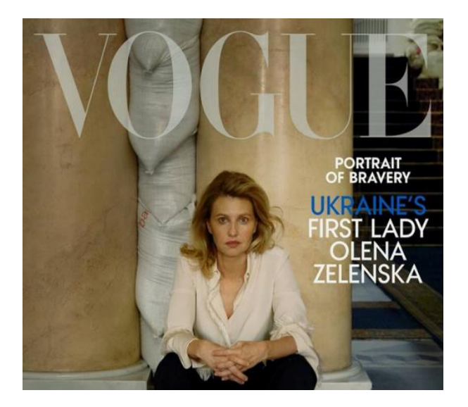
Figure 3 Olena Zelenska, Vogue Cover

Having powerful ethical, feminist, and political implications, it caused strong resonance in Ukrainian society and abroad, including hot discussions of its somewhat controversial aesthetics.