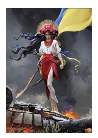
Figure 1 An Illustration of Ukraine

I'd like to start my deconstruction of Ukrainian identity bricolage by looking at pictorial images profusely used in present-day media to create the identity under analysis. Framing of the Russian-Ukrainian conflict through non-verbal signs of different nature can be very potential in modern multidimensional discursive environments, as they activate different ways of information transmission and information perception. Among multiple illustrations of Ukraine, deployed by the modern Ukrainian media, female images are among the most popular in metaphorizing Ukrainian identity. Usually, this " Ukraine-as-a-woman " construal (Fig. 1) is represented through the image of young, beautiful, and courageous woman.