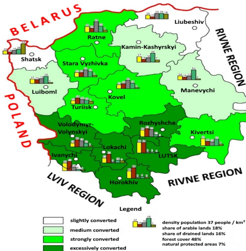
Picture 3. Map of the anthropogenic transformation of relief and soils Volyn region

The largest proportion of arable land together with drained in the Lutsk region 63.73%, the smallest in Volodymyr-Volynsky is 45.08% that is very high-resolution of the territory. The share of drained lands is the smallest in Locaminsky Paradise 7.66% and the largest in Rozhyshechesky is 30.23% (along with meadows). The protected fund of this group of districts