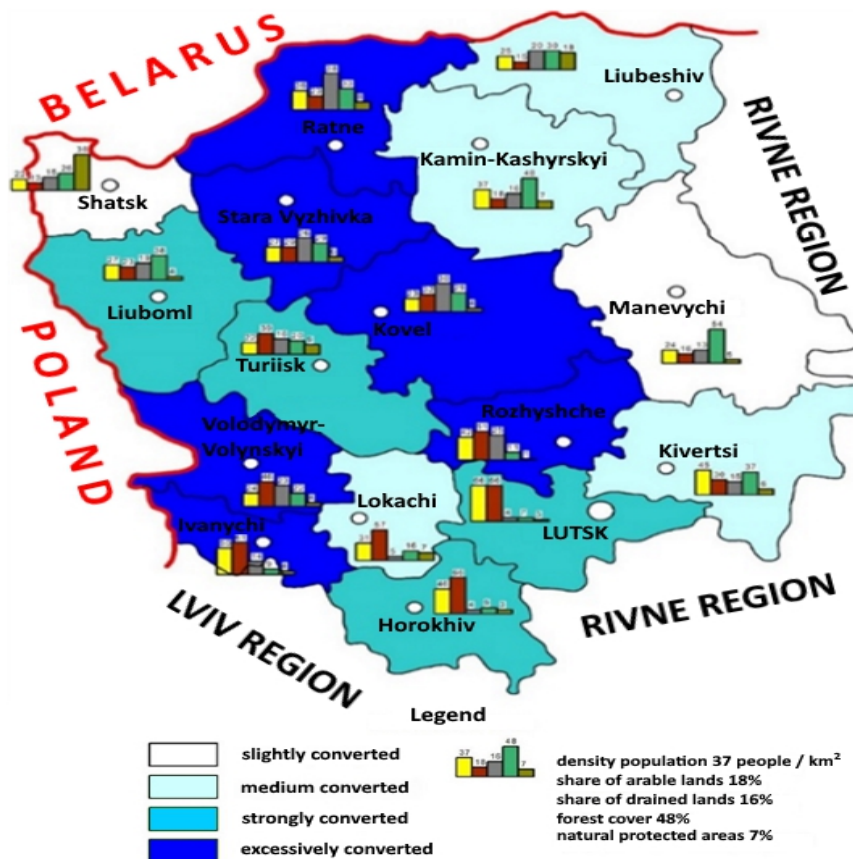
Picture 4. Map of anthropogenic transformation of water balance Volyn region

On the territory of areas with excessive conversion of relief and soils three of the four largest cities in the Volyn region: Lutsk, Volodymyr-Volynsky and Novovolynsk. The most developed agriculture are food, fuel industry and mechanical engineering. The density population is high enough: from 24.3 people / km 2 in Volodymyr-Volyn district (excluding the population of Vladimir-Volynsky) to 65.6 people / km 2 in Lutsk district. On average, this group of areas population is the largest within the region.