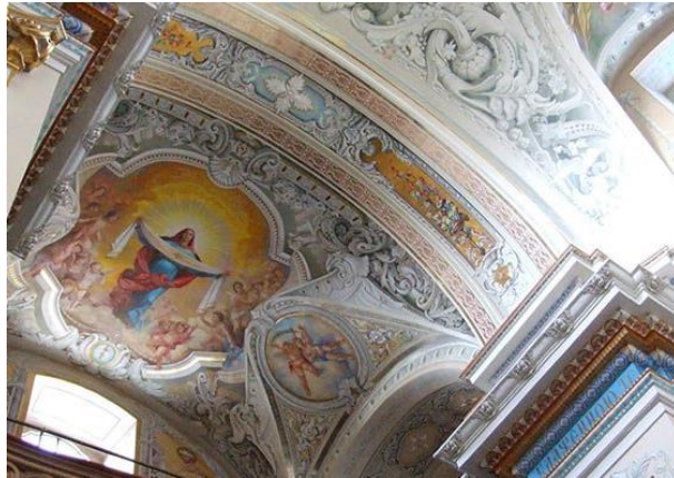
Figure 1. The image of the Holy Virgin. Artist Petro Shevtsov. (photo [9])