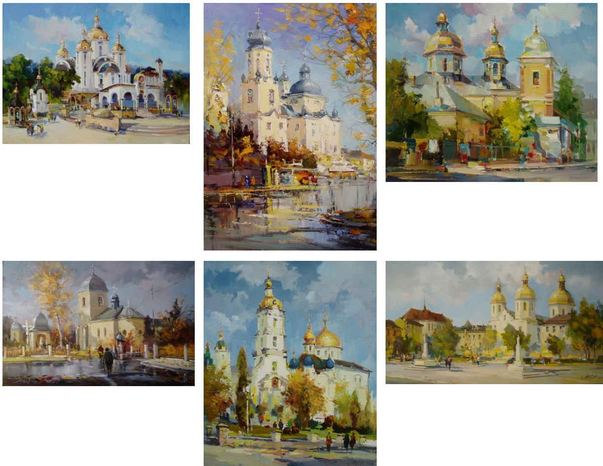
Figure 5. Painting works of architect Kuziv Mykhaylo

Data on the talented Ternopil architect and painter Mykhaylo Kuziv, known far beyond Ukraine, a participant of more than 70 art regional, regional, all-Ukrainian and international open-air shows, was put into scientific circulation.