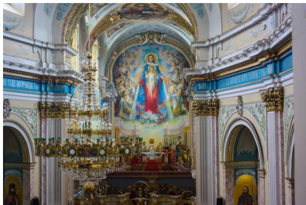
Figure 2. Icon of the Immaculate Conception of the Blessed Virgin (painted by Valeriy Lebed) (photo - [5])

Under the image of the Virgin the icon "The Last Supper" is depicted. Unlike traditional icons, it does not focus on the betrayal of Judas. A group of Ternopil artists worked on the painting for three years. The faces of the twelve apostles are drawn from the real characters of the Ternopil clergy, artists, actors, parishioners of the cathedral. This technique has caused much criticism and discussion [5, 7].