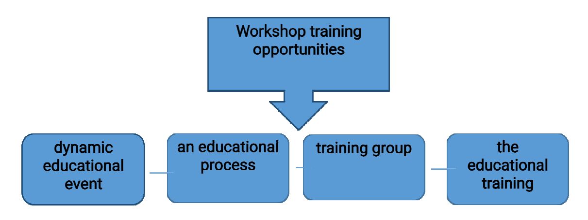
Fig. 1. Workshop training opportunities (by K. Fopel)

The founder of the efficient workshop theory K. Fopel examines this phenomenon comprehensively as: 1) dynamic educational event where participants learn through their own activity; 2) an educational process in which everyone takes part and during which participants learn a lot from each other; this process focuses on the experiences and impressions of participants after graduation allowing them to become more competent; 3) the educational training results of which depend more on the participants' contribution than on the leaders knowledge [6] ( see. Fig. 1 ).